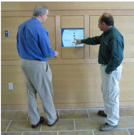
Touchscreen kiosk in lobby